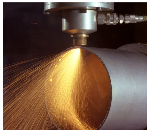
Laser cutting - a non-contact method utilising lightweight deployment